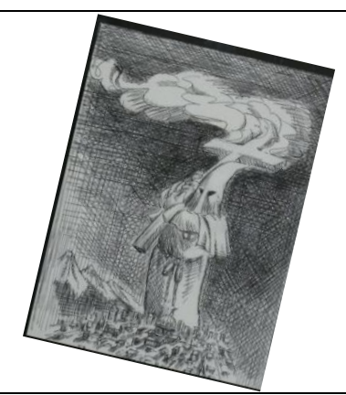
Cover of "Hooded Empire" © 1983 Robert Goldberg